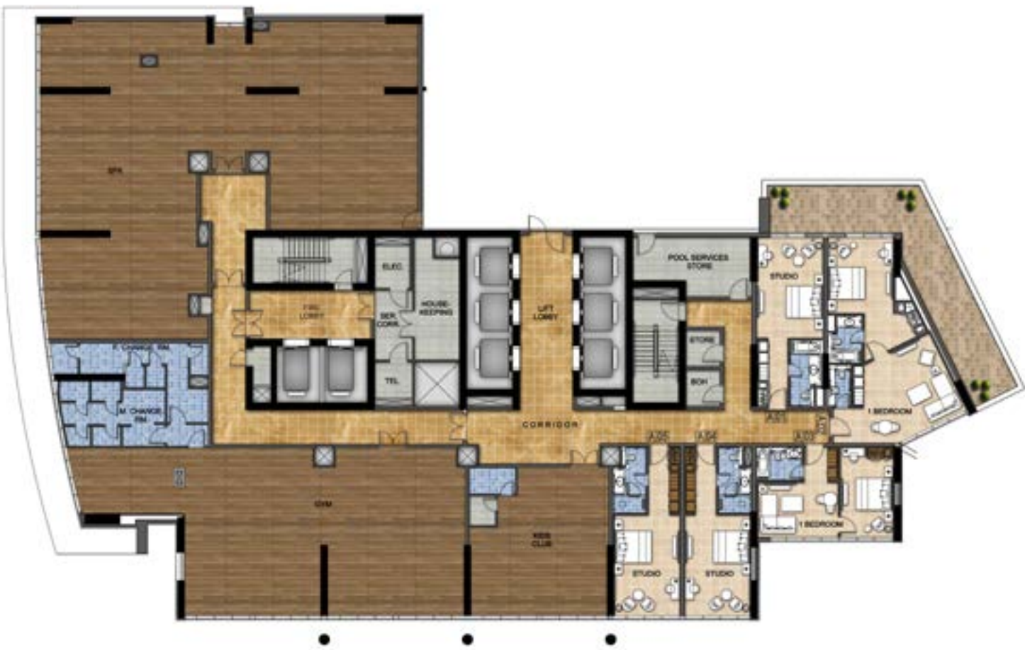
TOWER A / LEVEL 3