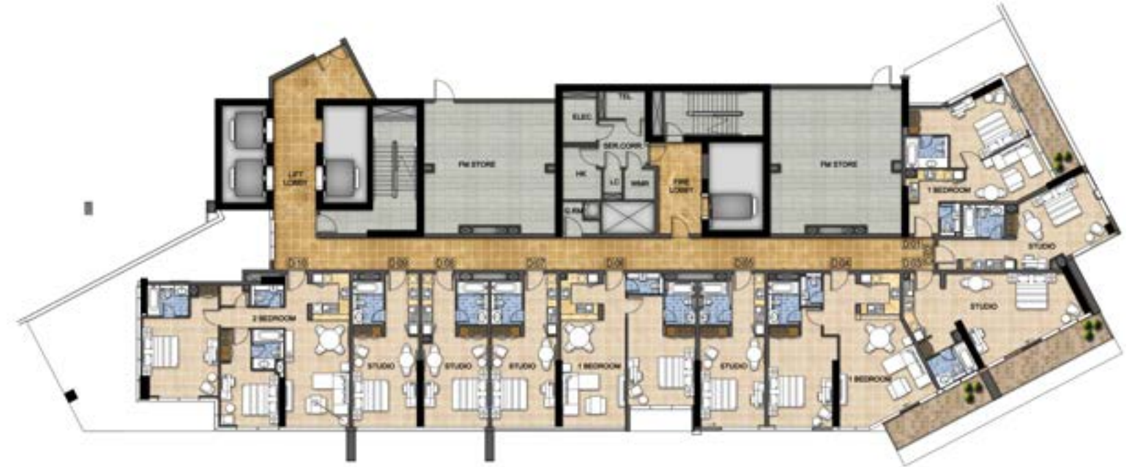
TOWER D / LEVEL 2