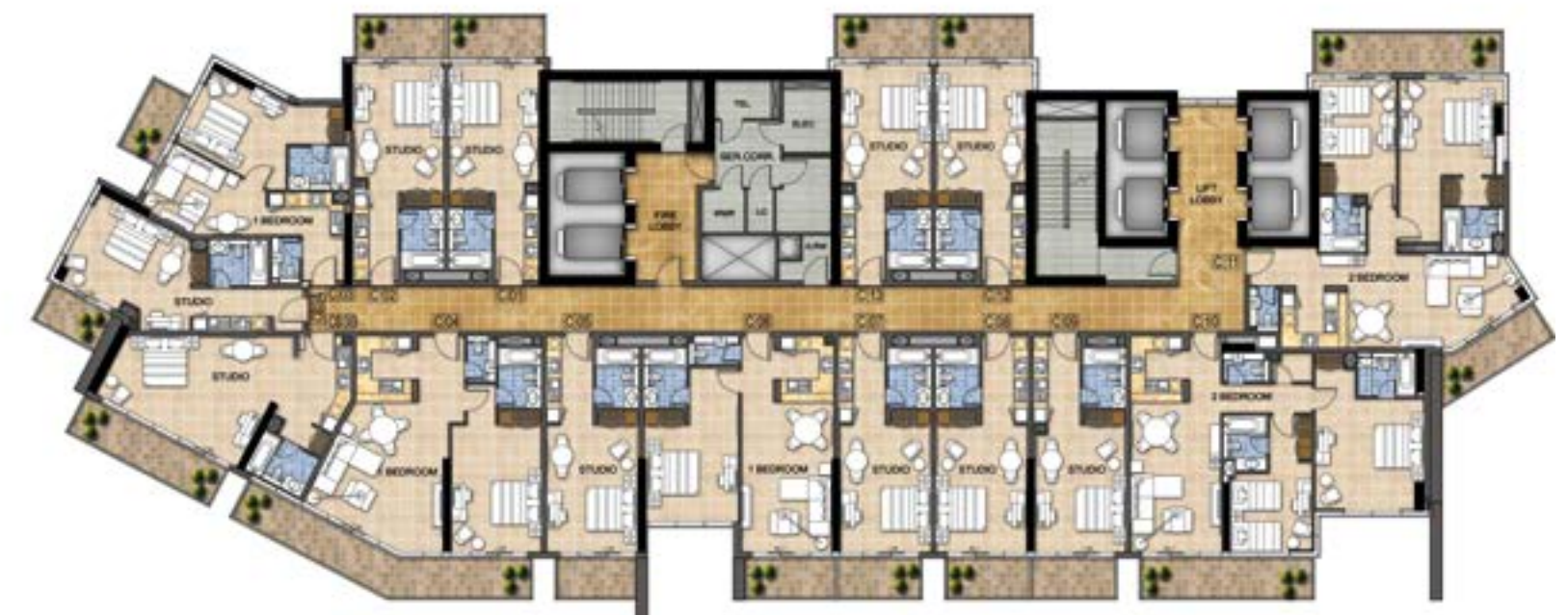
TOWER C / LEVEL 11