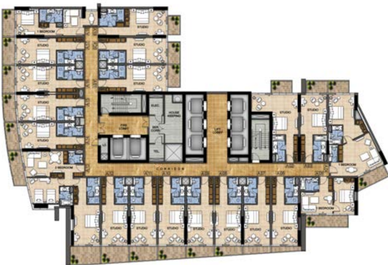
TOWER A / LEVEL 4