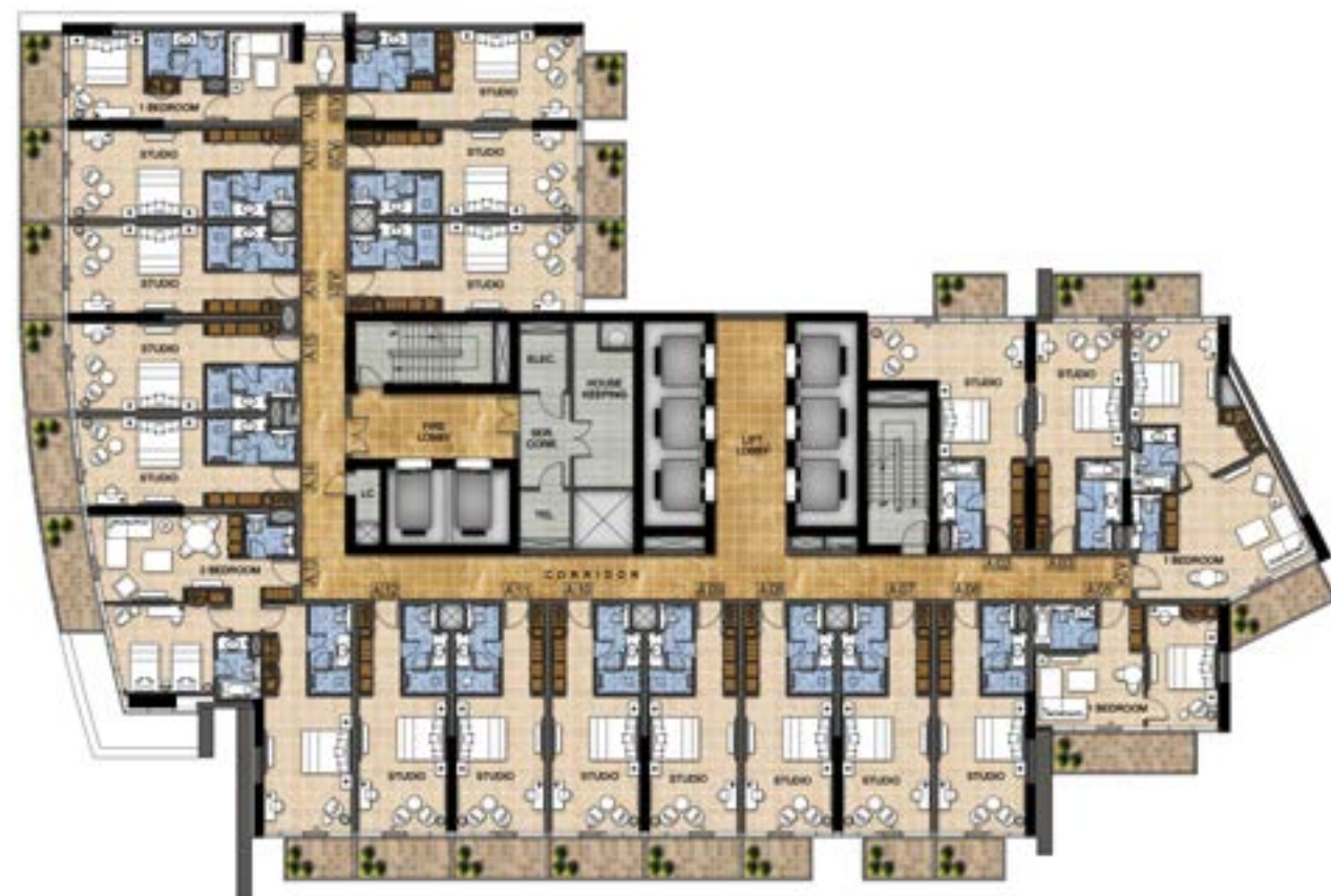
TOWER A / LEVELS 9 & 15