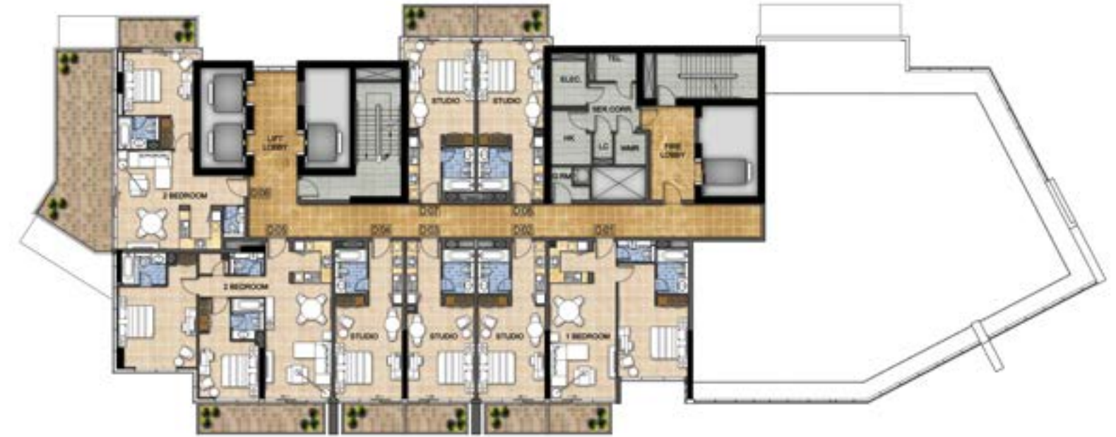
TOWER D / LEVEL 18