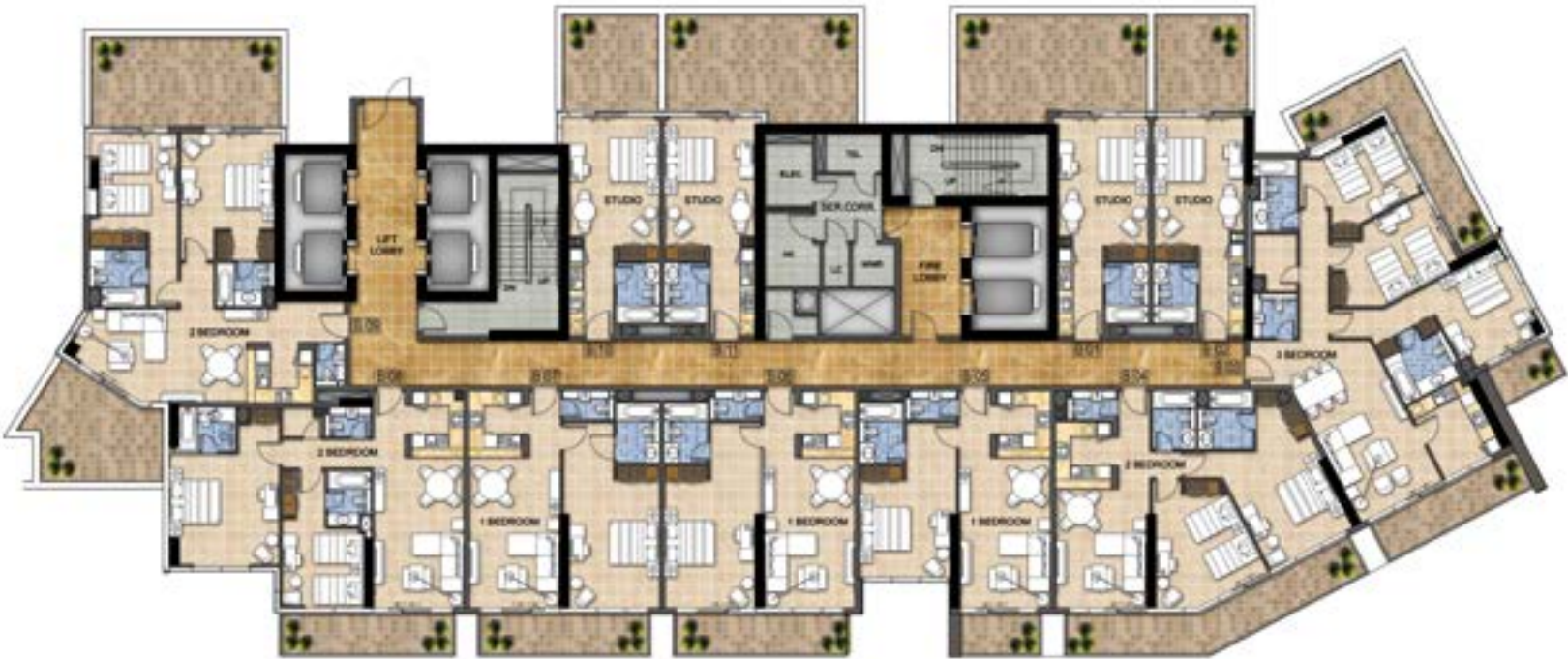
TOWER B / LEVEL 3