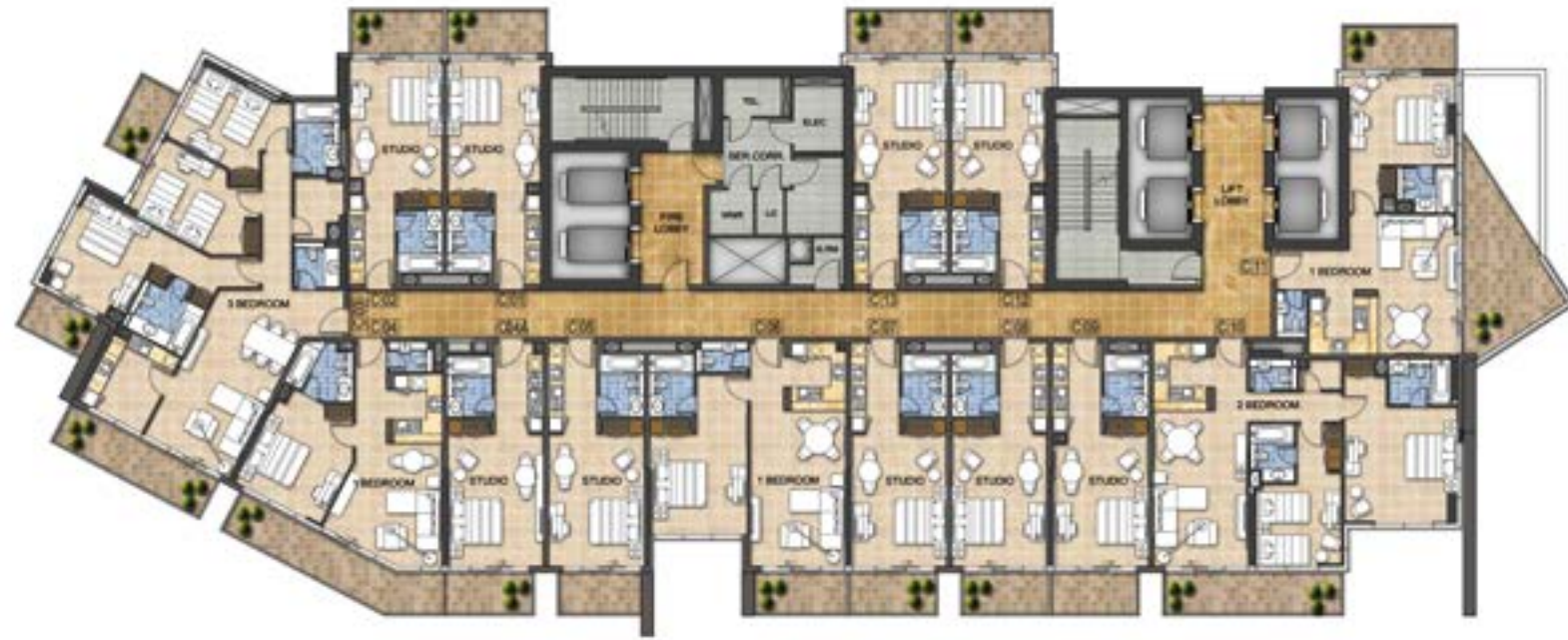
TOWER C / LEVEL 17