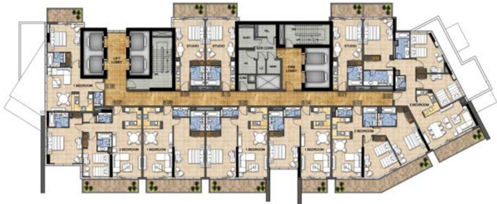
TOWER B / LEVEL 21