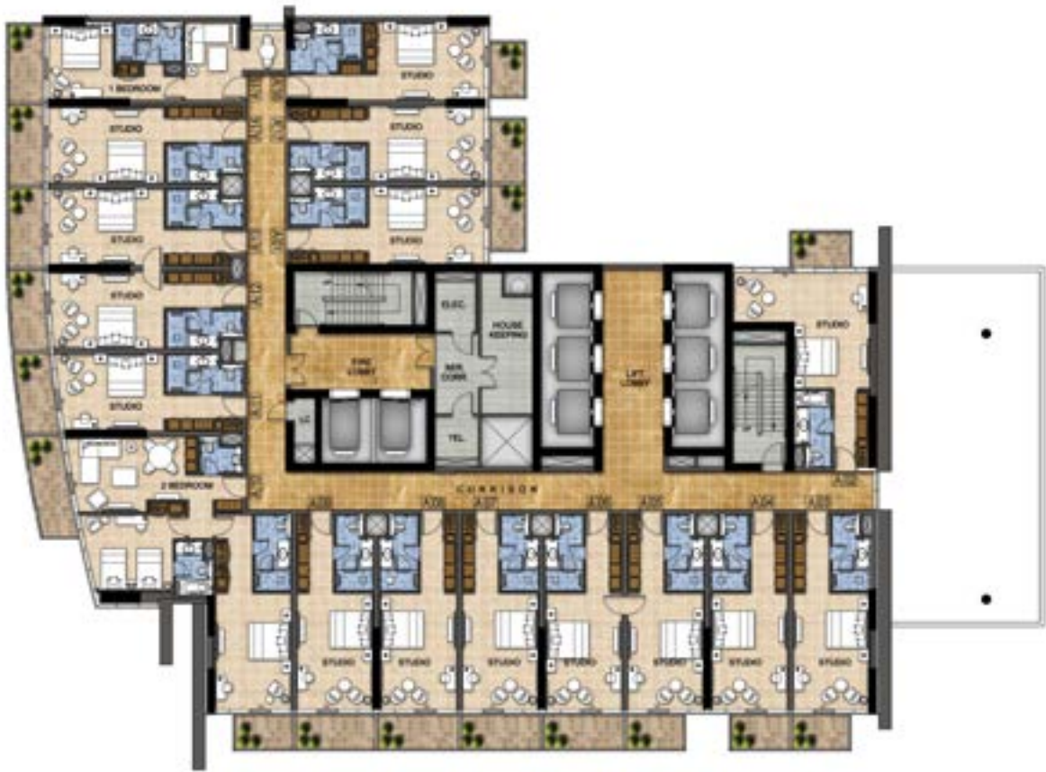
TOWER A / LEVEL 24