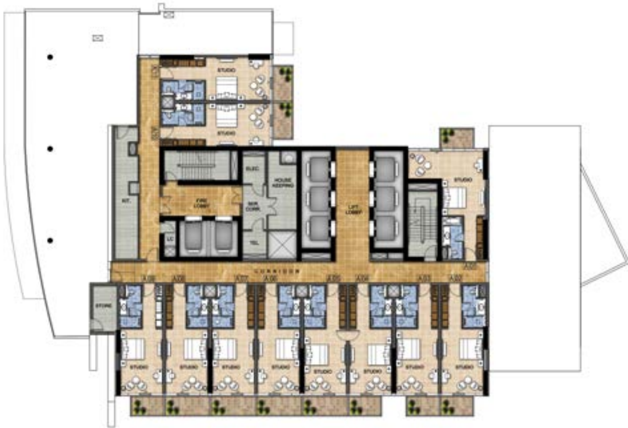
TOWER A / LEVEL 27