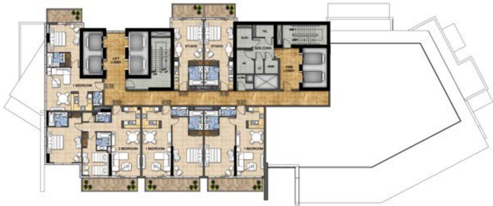
TOWER B / LEVEL 23