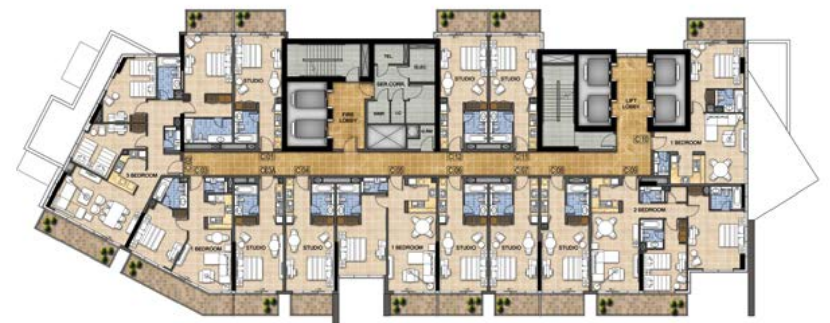
TOWER C / LEVEL 19