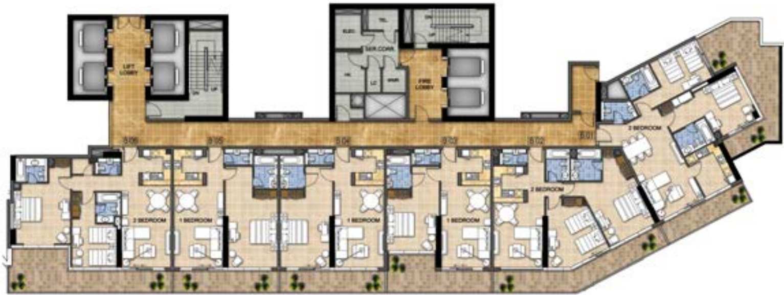
TOWER B / LEVEL 2