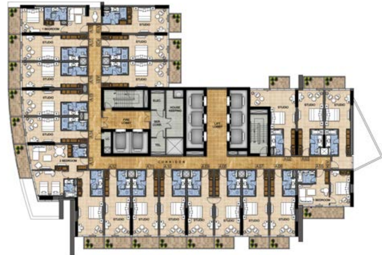
TOWER A / LEVEL 21