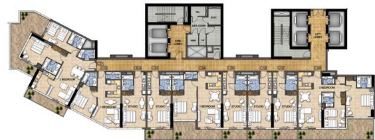
TOWER C / LEVEL 3