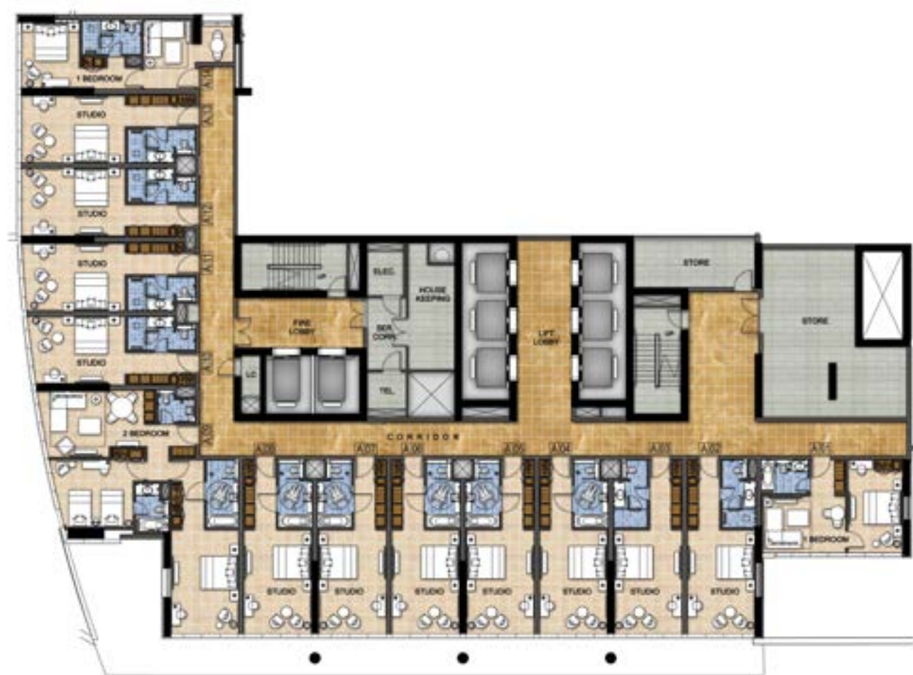
TOWER A / LEVEL 2