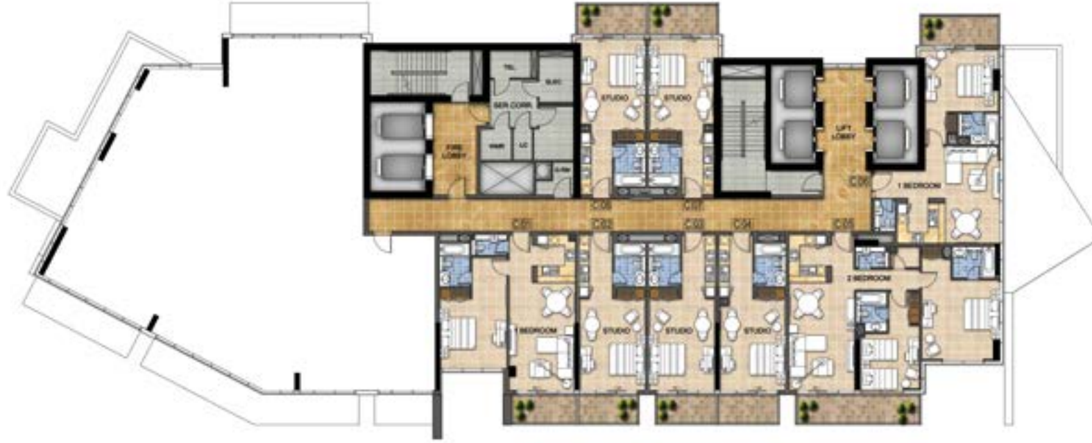
TOWER C / LEVEL 21