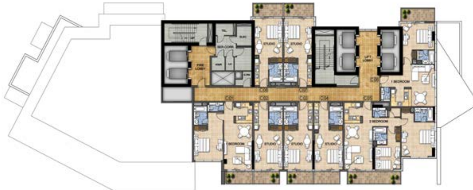
TOWER C / LEVEL 22